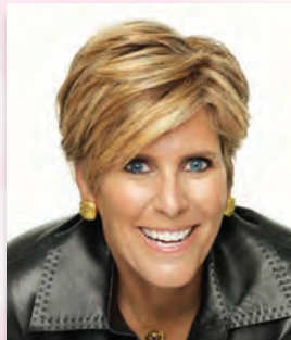
Suze Orman 2011 PSA Spokesperson