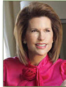
AMB. NANCY G. BRINKER Founder and Chief Executive Officer Susan G. Komen for the Cure®